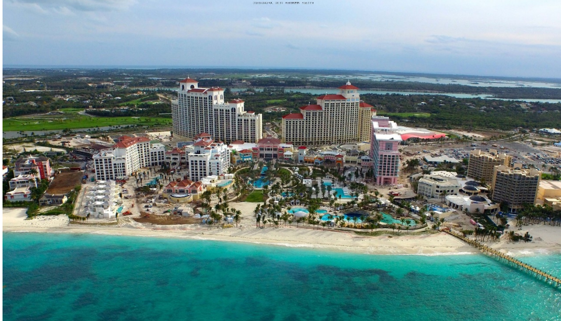
Exhibit 1: Baha Mar Project Development Plan