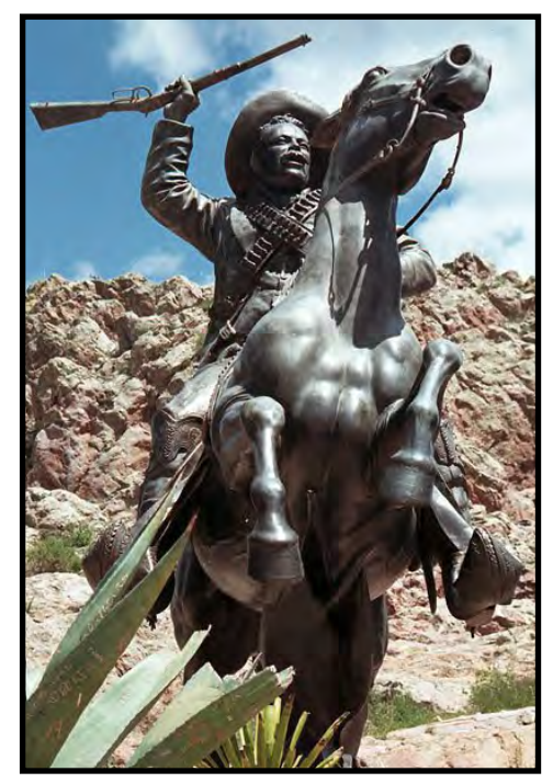
Monument to Pancho Villa, Cerro de la Bufa, Zacatecas.