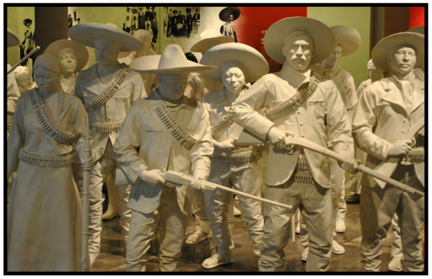
Exhibit in the Museum of the Mexican Revolution, Mexico City.