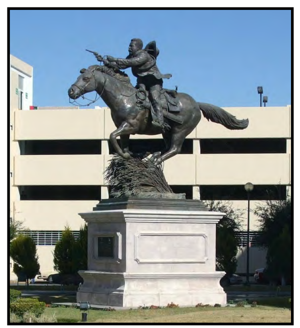
Monument to Pancho Villa, Chihuahua.