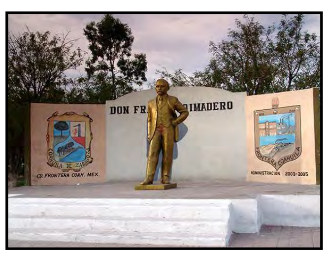
Monument to Francisco Madero, Ciudad Frontera, Coahuila.