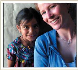
Waiting with a beautiful little girl in one of the comunidades, while her best friend was checked for asthma.